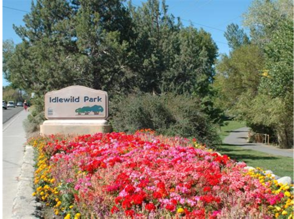
Idlewild Park, Reno, Nevada